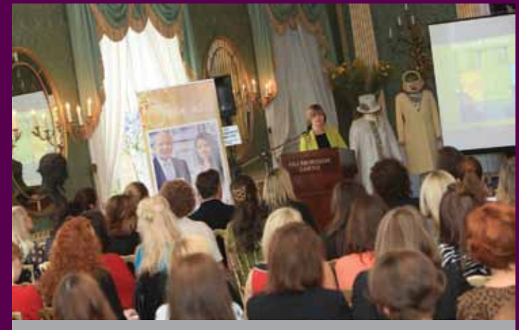
Networking for Growth Event at Hillsborough Castle 'Excellent opportunity to meet and grow my connections, leaving inspired and energised' – Event Attendee