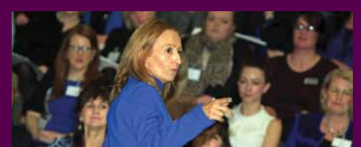
These Dreams are Made for Walking Masterclass 'Great event – a positive mind will be returning to the office – Event Attendee

The lasting legacy of our autumn/winter events schedule is that the awards, business lunches, masterclasses, workshops, regional events and networking breakfasts provided members with unrivalled sustainable networking opportunities and more than 5,000 business connections.