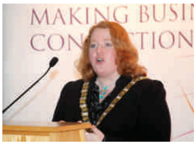
Belfast Lord Mayor Naomi Long addresses members

The Right Honourable the Lord Mayor, Councillor Naomi Long, opened the event. She said: "It is important that we celebrate the role of women in business, women who are entrepreneurs and who are driving forward this economy.