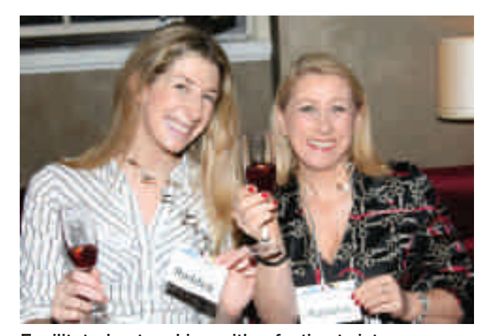
Facilitated networking with a festive twist