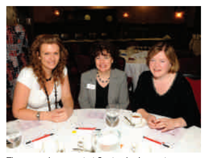
Three members meet at September's event